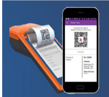
Figure 4 Dynamic QR Code