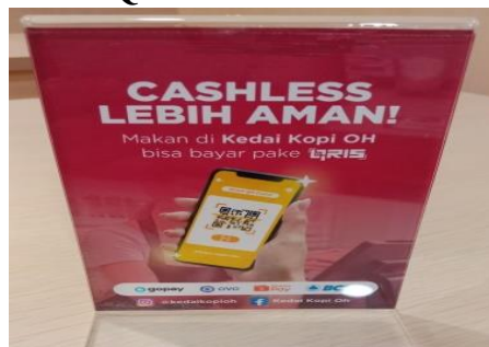
Figure 5 QRIS in merchant

MSME trader in clothes shops in modern markets, Lili (25 years old) that consumers currently use non-cash or cashless, especially during a pandemic, many people are reluctant to hold cash, also for reasons of not having direct contact.