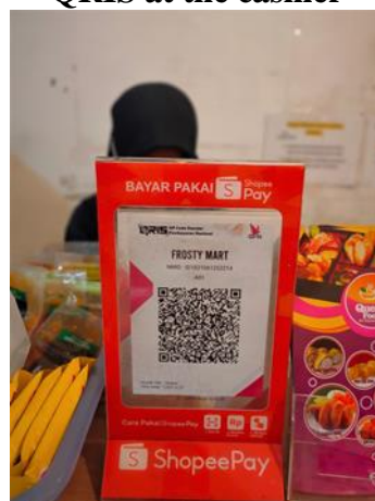
Figure 6 QRIS at the cashier