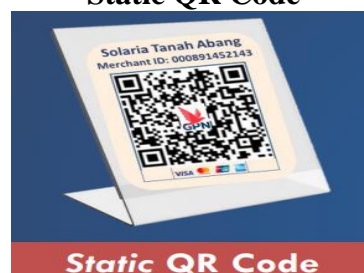
Figure 3 Static QR Code

There are 2 types of QRIS on Merchant issued by Bank Indonesia, (1) Static QR Code and (2) Dynamic QR Code