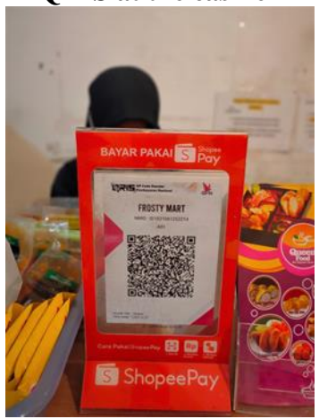
Figure 6 QRIS at the cashier