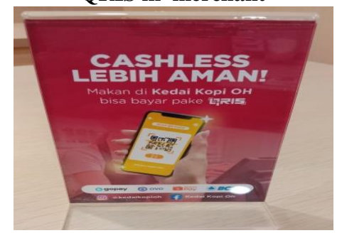
Figure 5 QRIS in merchant

MSME trader in clothes shops in modern markets, Lili (25 years old) that consumers currently use non-cash or cashless, especially during a pandemic, many people are reluctant to hold cash, also for reasons of not having direct contact.